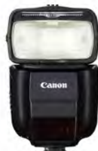
SPEEDLITE 430EX III-RT