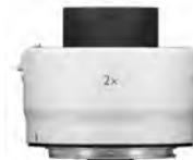
Extender RF2x (Tele Converter) MRP: ₹54 995.00/U incl. of all taxes

All prices are subject to change. For latest prices, please visit in.canon and visit the relevant product section. More range of RF Lenses available. For more details, visit in.canon . EMI options available with Bajaj Finance | HDFC Bank | IDFC First Bank | Pine Labs. EMI finance is at sole discretion of Financier/Bank/Service Provider to customer. EMI options are available at select stores. To know detailed T&C of EMI, please visit : https://in.canon/en/consumer/web/emi-cashback-offers . All images and effects are simulated, actual image may vary.