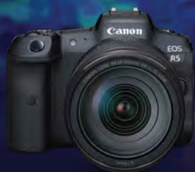
Captured on EOS R5, RF 85mm f/1.2L USM DS