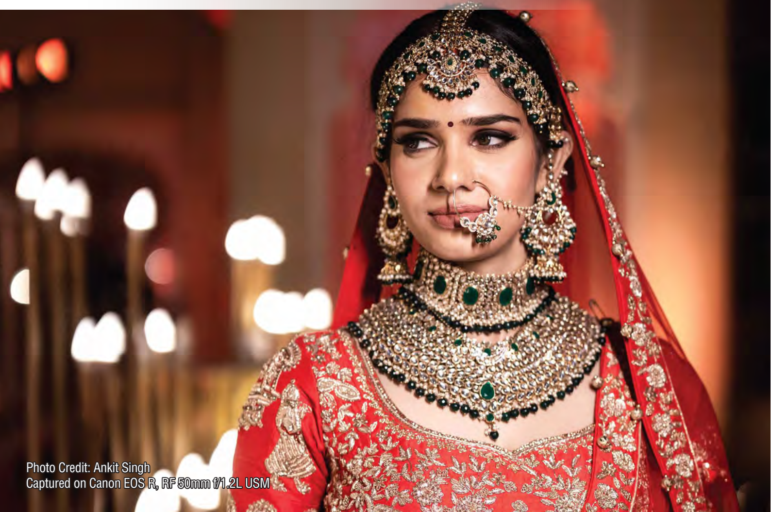
Captured on Canon EOS R, RF 50mm f/1.2L USM