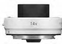
Extender RF1.4x (Tele Converter) MRP: ₹45 995.00/U incl. of all taxes