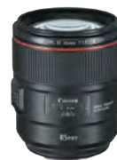
EF85mm f/1.4L IS USM MRP: ₹ 147 995.00/U incl. of all taxes