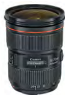
EF24-70mm f/2.8L II USM MRP: ₹ 164 995.00/U incl. of all taxes