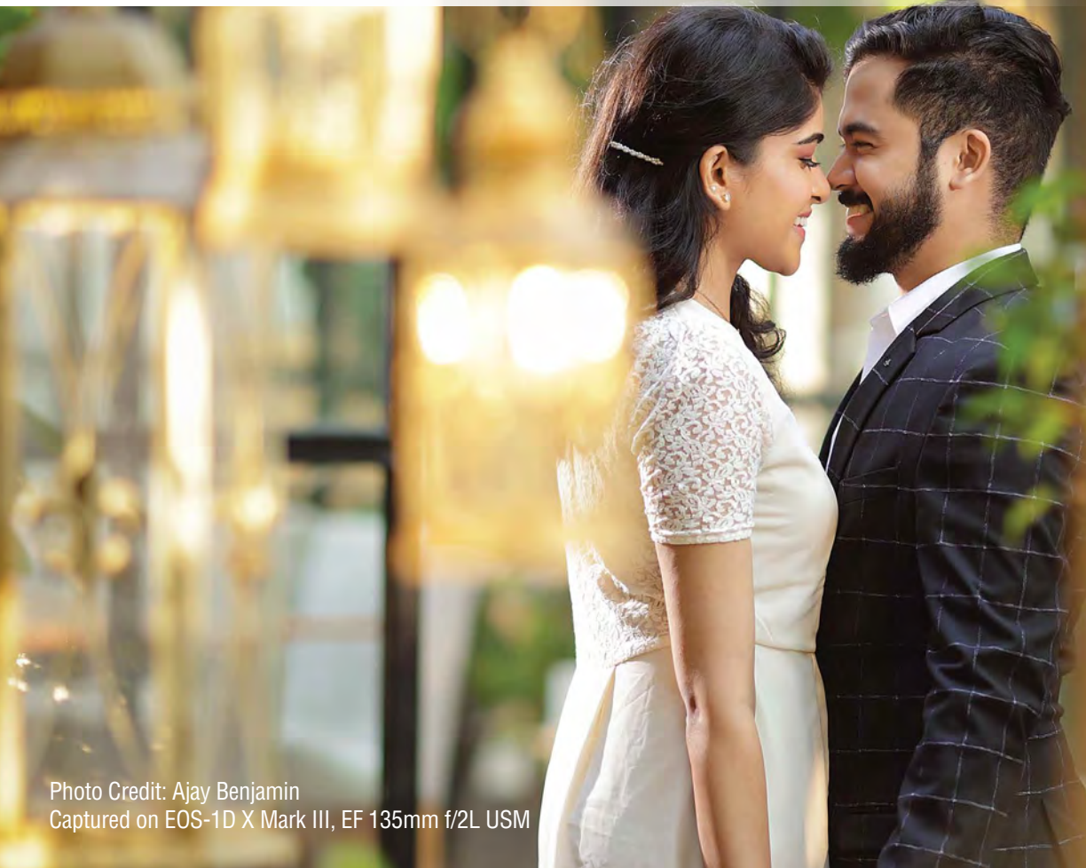
Captured on EOS-1D X Mark III, EF 135mm f/2L USM