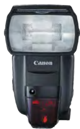
SPEEDLITE 600EX II-RT

Canon Speedlites feature advanced technologies to reduce power consumption and control heat. With Wi-Fi, you can even remotely trigger groups of compatible flashes that are placed behind obstructions. Our flagship flashes also offer weather sealing and ruggedness that match our professional DSLR cameras.