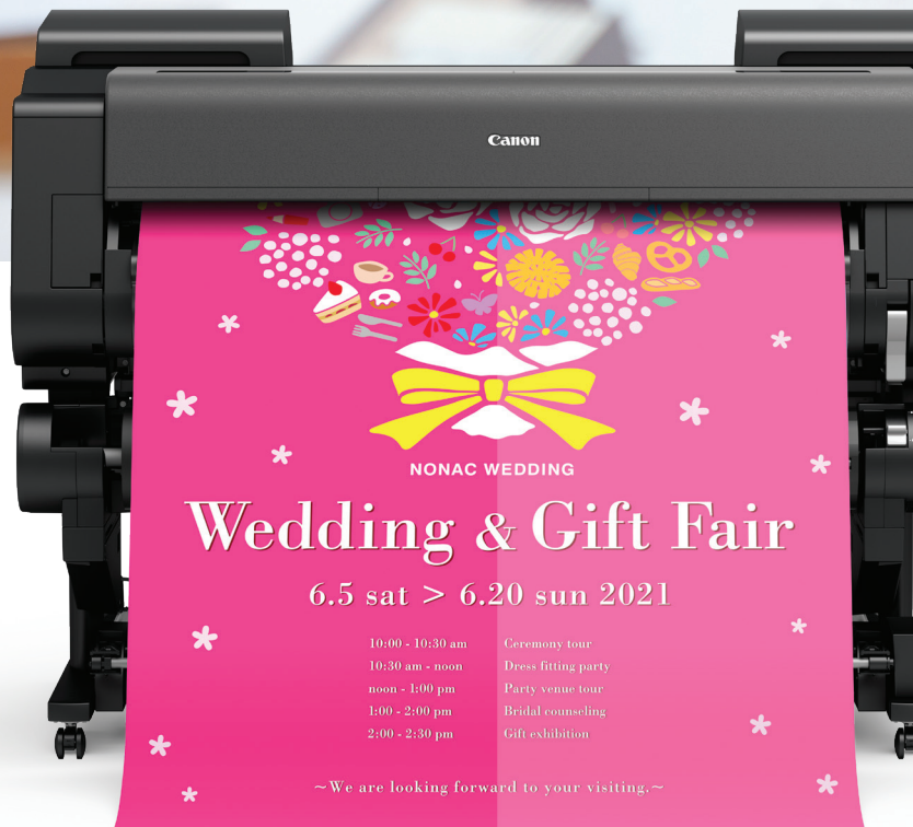
with fluorescent ink