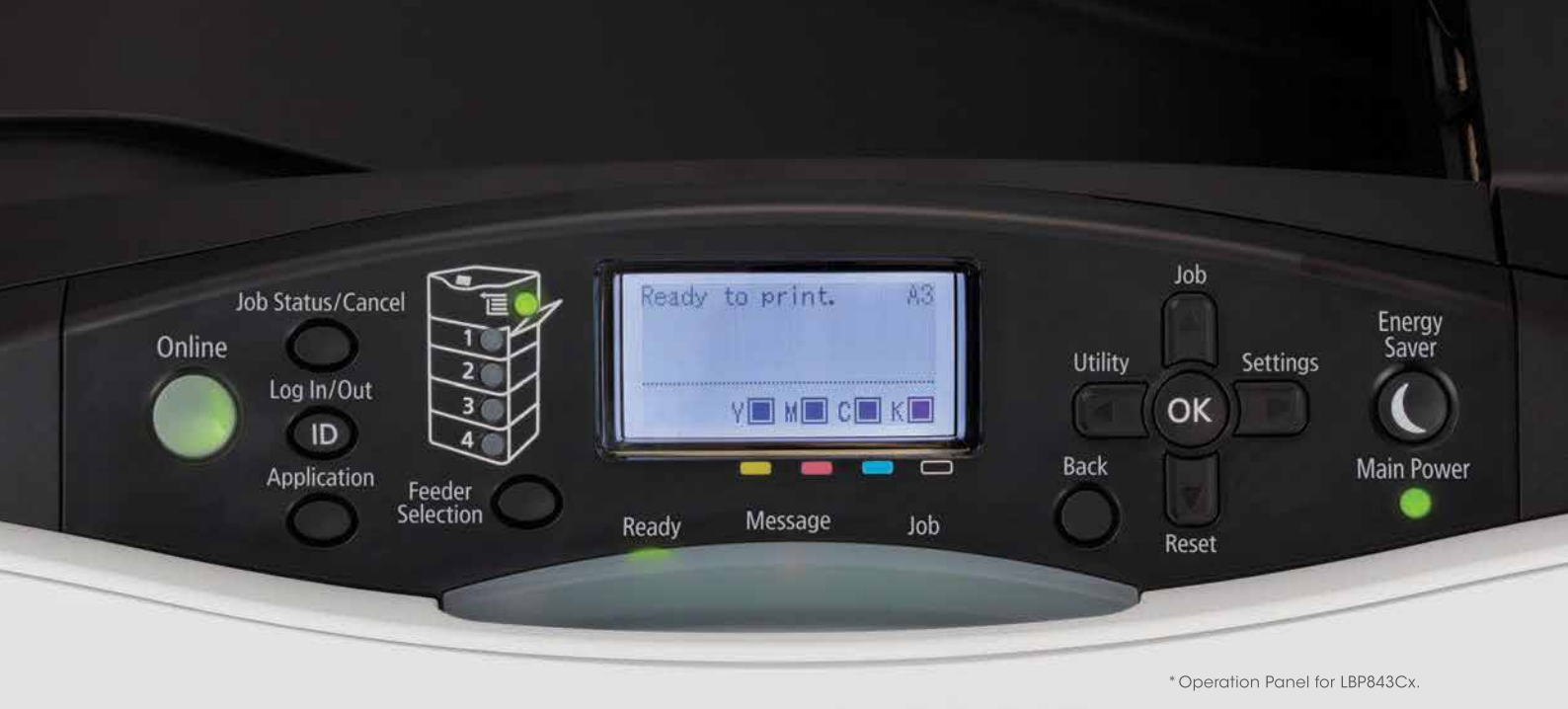
* Operation Panel for LBP843Cx.